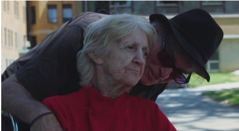
J'AI PLACÉ MA MÈRE IS ONE OF SEVEN CANADIAN FEATURES IN COMPETITION AT RIDM

APRIL 27-MAY 7, 2023 CANADIAN INTERNATIONAL DOCUMENTARY FESTIVAL